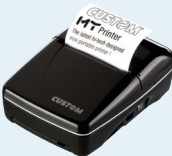
MY PRINTER X