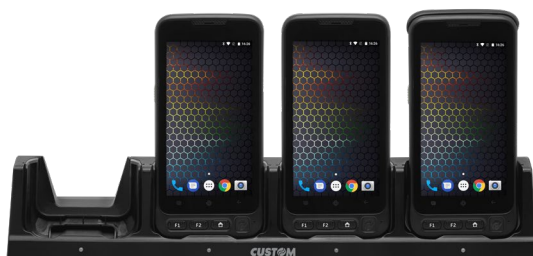
4 slot cradle