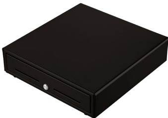
BIG metal drawer dim. 330 x 90 x 330 mm