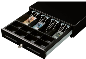
TOP metal drawer dim. 410 x 100 x 415 mm