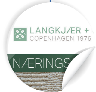
Present company logo in brand colours