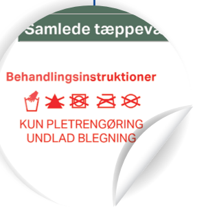
Highlight key care instructions