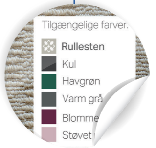
Indicate other colours available in the range