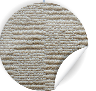
Show colour and texture of product