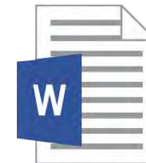
WT6300 50/100/200 Word Descriptions