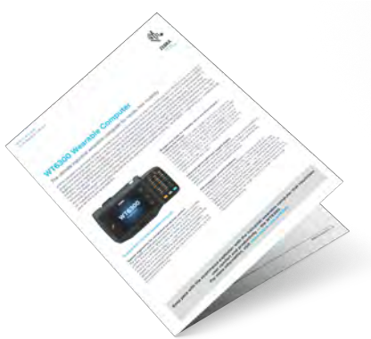
WT6300 Specification Sheet