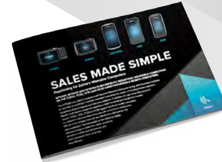
Wearable Computers Guide to Practical Selling