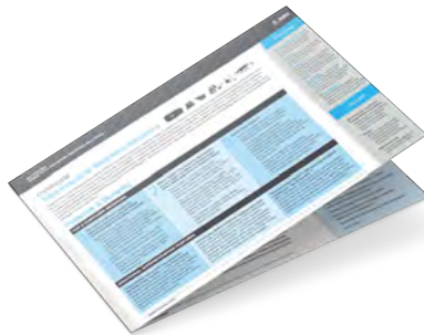
Industrial Wearable Sales Battle Card