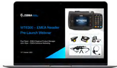
WT6300 Wearable Computer Channel Briefing Webinar