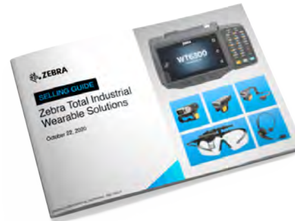
Industrial Wearable Selling Guide Presentation (pdf)