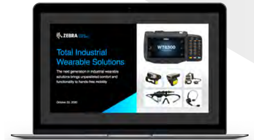
Customer-facing Presentation (.pptx)