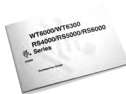
Wearable Computers Accessories Guide