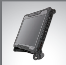
A140 with Multi-Function Hard Handle as Kickstand